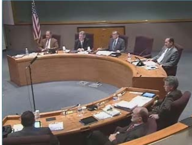
Brea City Council – Dec. 6, 2011

This was a great City of Brea Council meeting! The Brea Historical Society had the opportunity to speak to the Mayor and Honorable City Council about the Brea Museum & Cultural Center, upcoming events, membership, our new Executive Director as well as announce the publication of our new pictorial book entitled "Brea, Then and Now".